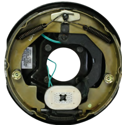
ELECTRIC BRAKE ASSEMBLY